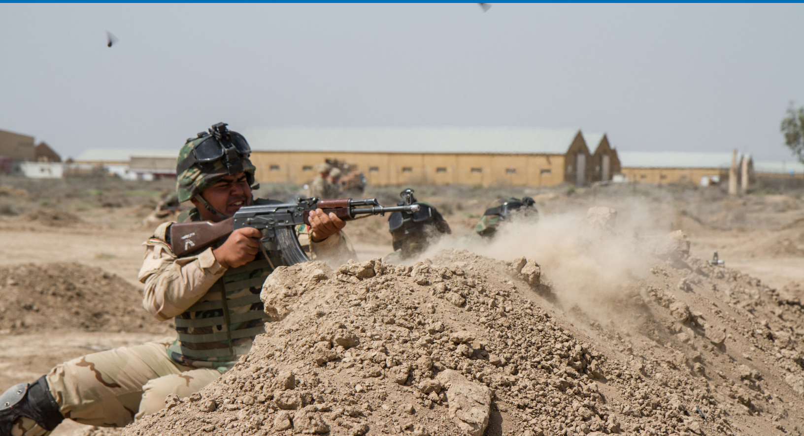
At Camp Taji, Iraq, in March 2015, Iraqi soldiers train with U.S. soldiers from the 3rd Brigade Combat Team, 82nd Airborne Division, which was deployed as part of Combined Joint Task Force - Operation Inherent Resolve to advise and assist Iraqi security forces in their fight against the Islamic State of Iraq and the Levant.

that, at the least, strengthening security forces at the expense of a focus on building strong, accountable civilian institutions can perpetuate the type of environment in which violent extremist organizations thrive and actually exacerbate, over time, the threat to the United States and its partners.