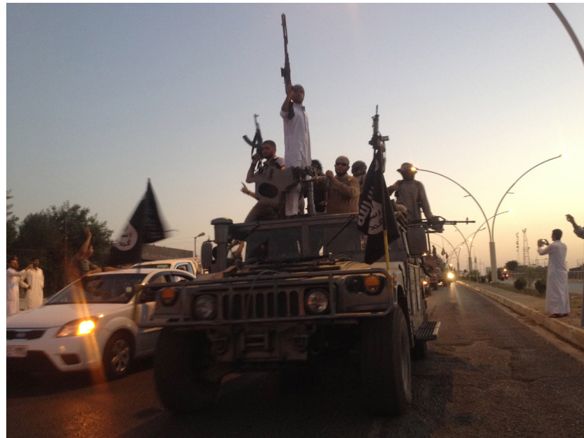
Fighters from the Islamic State group parade in a commandeered Iraqi security forces armored vehicle on the main road at the northern city of Mosul, Iraq, on June 23, 2014. The authors note that ISIS' defeat of the Iraqi security forces in 2014 is a reminder of the limits of U.S. security assistance when the broader political and sectarian challenges undermine the capabilities and will of partner security forces.

Research has shown that whether the United States is working with ideal or suboptimal partners, the efficacy of security assistance and cooperation intended to build partner capacity increases dramatically when U.S. and partner objectives for how that BPC will be used are in alignment. 25 In short, sharing a similar threat perception matters. For example, in Lebanon, after Syria withdrew its forces in spring 2005, there was a sudden opportunity to support the Lebanese Armed Forces (LAF)