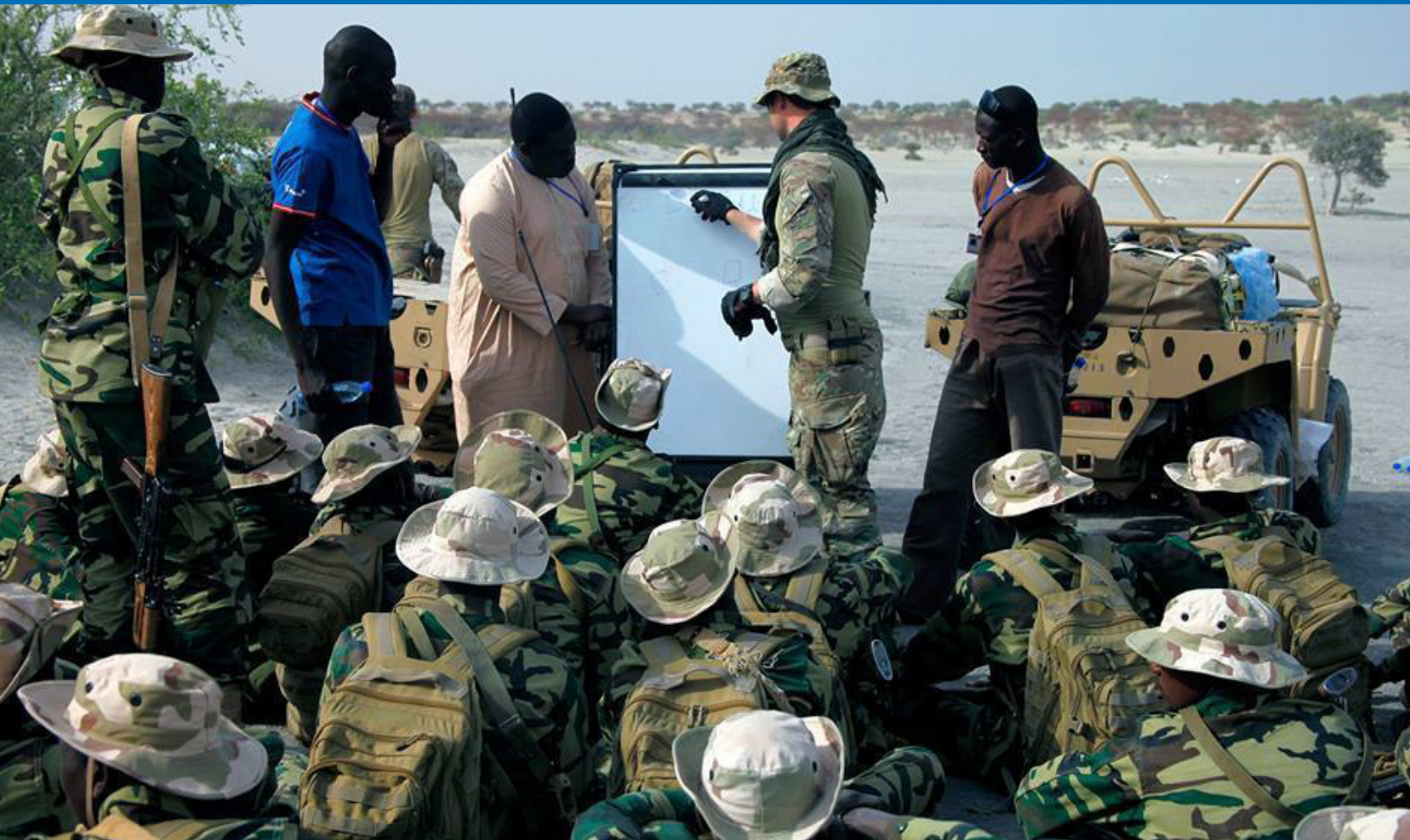
A U.S. Army soldier from 10th Special Forces Group (Airborne), Fort Carson, Colorado, conducts a class covering mounted patrols to a Chadian platoon during Exercise Flintlock 2015 in Moussoro, Chad. Exercise Flintlock promotes regional cooperation with U.S. African partners, focusing on military interoperability and capacity building.

The use of new authorities to train and equip partner militaries to enhance their capability to conduct counterinsurgency and counterterrorism operations reflects three realities, learned in part through the challenges of 14 years of war in Iraq and Afghanistan. First, U.S. policymakers are likely to remain reluctant to deploy troops to every country where violent extremist movements threaten U.S. interests. Second, not all violent extremist movements pose an equivalent threat to the United States. Third, a large-footprint U.S. military presence can be counterproductive, as it may contribute to the radicalization of new militants and generate more anti-Americanism.