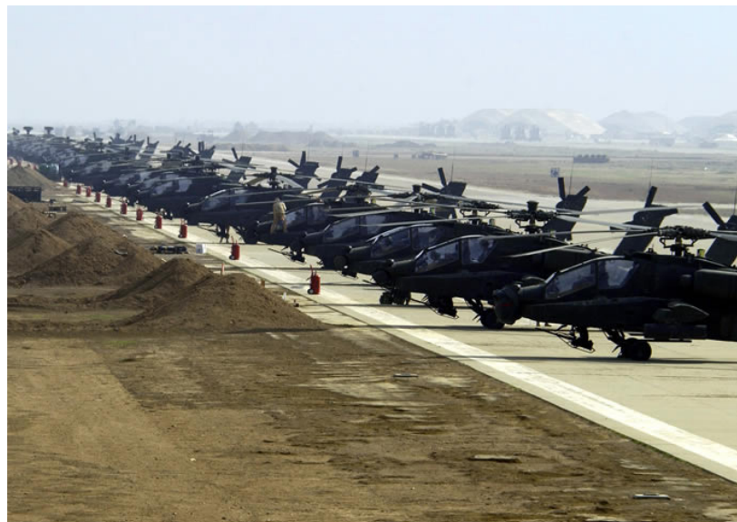
After the Arab Spring, differences over conditioning U.S. assistance and cooperation have become more pointed. In October 2013, the Obama administration placed holds on the delivery of Apache helicopters (pictured here at an airfield in Iraq) and other equipment to Egypt after the Egyptian military's support for the violent crackdown against Egyptian protestors. The Apaches were eventually released to Egypt in 2014.

The United States also withheld all FMS to Bahrain in 2011 after the government under King Hamad al-Khalifa violently responded to the peaceful demonstrations that year. The United States released the sale of all but a few weapon systems in 2012, however. Senior policymakers explained that the remaining holds on FMS items included a number of discrete categories of weapons, including those that could be used against peaceful protestors. Speaking to Congress and outside advocacy groups concerned about the Bahraini domestic situation, the White House and State Department described the arms sales hold as a diplomatic lever, a way to encourage political reform and implementation of the recommendations offered by the Bahrain Independent Commission of Inquiry report in November 2011. 49